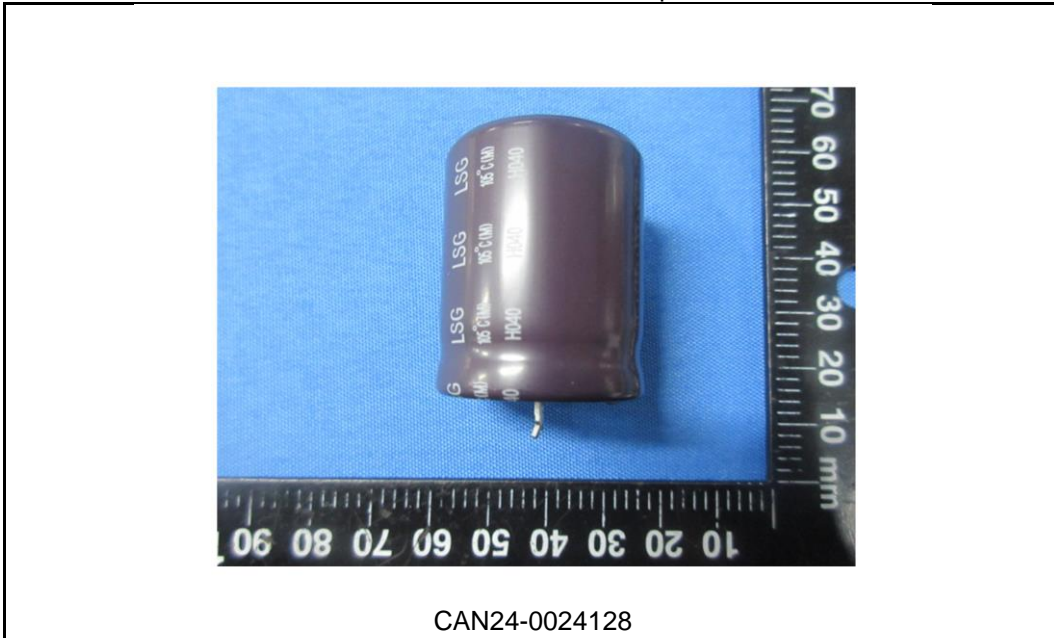
Photo of Submitted Sample

SGS authenticate the photo on original report only